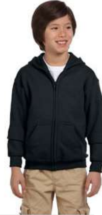
Color Shown: Black