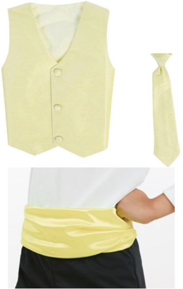
BOY COSTUME: Above items plus a bowtie and gloves matching the girl tap version